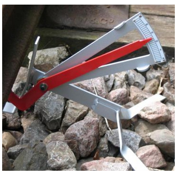
Figure 1 - Detail A

Place the Void meter underneath the track between two sleepers and set the scale to read 0. The pointer end should be touching the underside of the rail, so that when the train passes over, the pointer will indicate the amount of deflection as indicated in "Detail A".