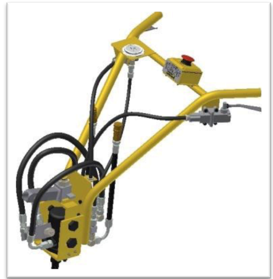
FP-163-1 (Trackpack Head)